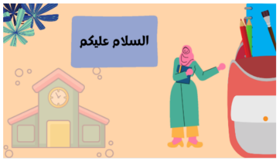
Figure 4. Revised Video Scene View