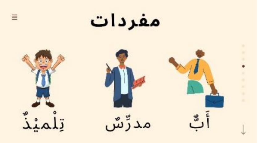
Figure 3. Mufradat introduction view

The next step is the first limited field test. The result data from the limited trial is then analyzed and evaluated to improve audiovisual media further. To ensure that the learning media fulfill the curriculum requirements, this research was tested on several grades 1 students in Madrasah Tsanawiyah. In limited field trials, there is usually not much input so that videos are suitable for use in the learning process in the classroom.