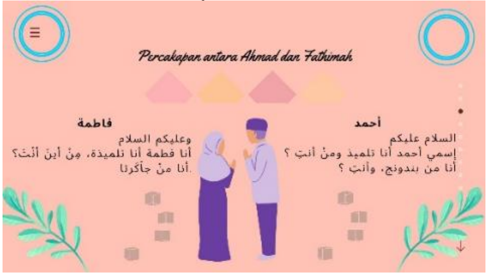
Figure 5. Conversations About At-Ta'aruf

After the revision, the test was conducted to a larger step, namely the field test. The process at this step is to implement the product as a product developed in a wider area and under more practical conditions. It was conducted in Arabic subjects Grade 1 Madrasah Tsanawiyah. The test aims to find out the usefulness and benefits of developed videos.